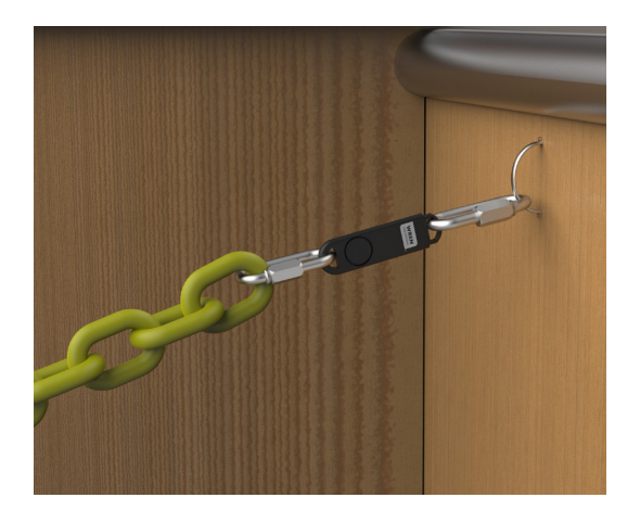
Wren Closed Lane Deterrent